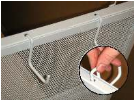
STEP # 5

STEP #4: USING THE 1/2" LG SCREWS, FASTEN THE CORNER BRACES.