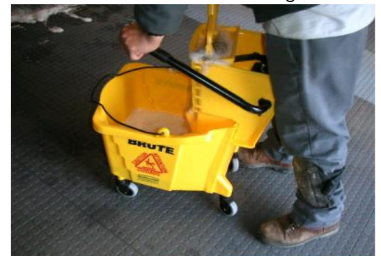
Step 4: Mop, hose or power wash with clean water.