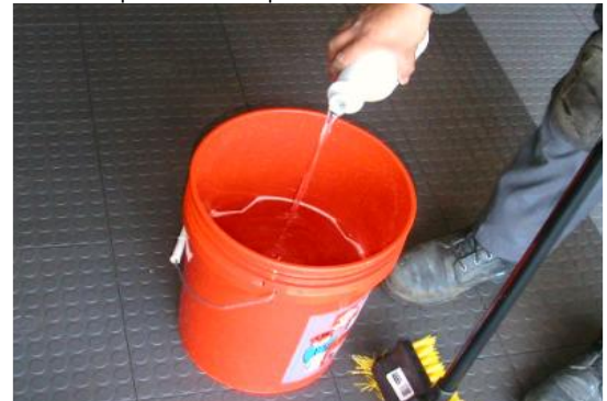
Step 2: Add citrus-based cleaner to hot water