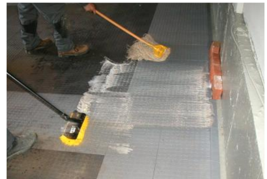
Step 3: Brush, mop or power wash floor. Use Mr. Clean Magic Eraser for tough stains