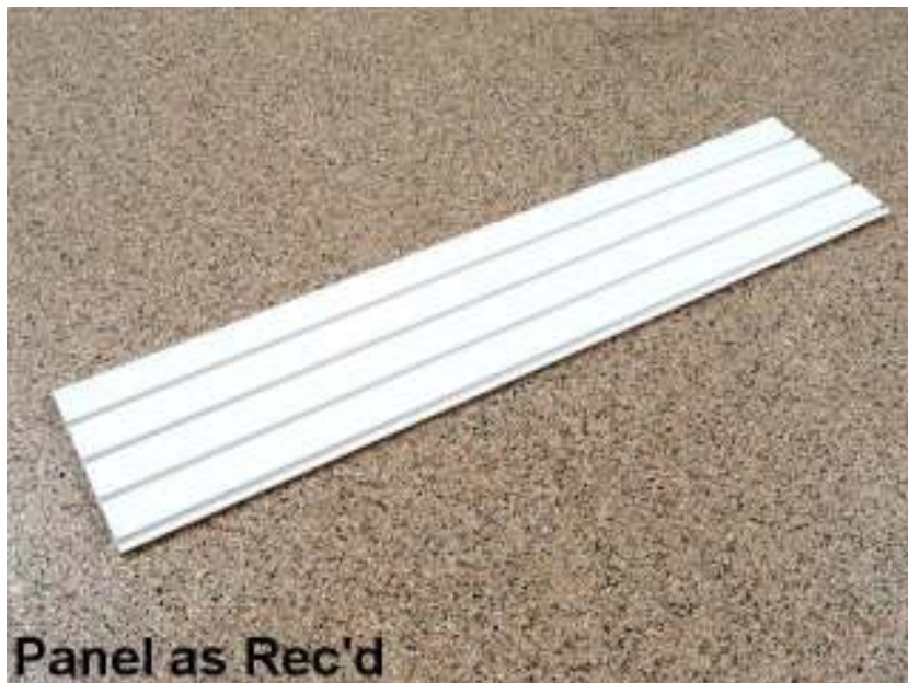
Panel as Rec'd

PLEASE READ THE COMPLETE SET OF INSTRUCTIONS“ BEFORE STARTING THE PROJECT.