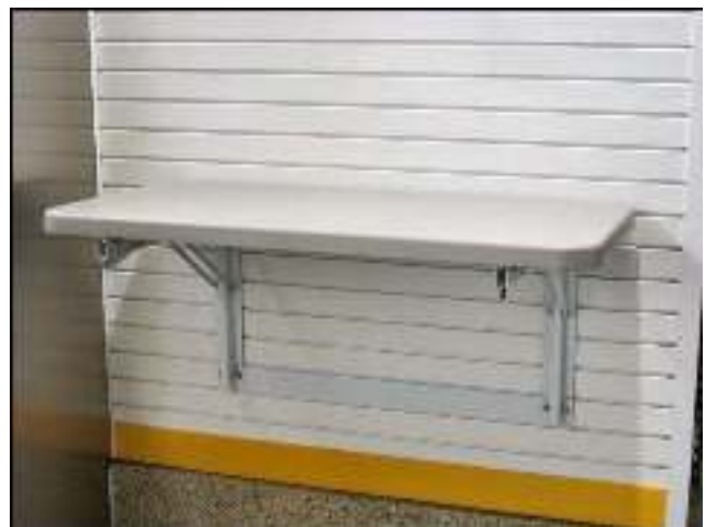
THIS COMPLETES THE GT1301 ASSEMBLY.

STEP #7: WITH THE SUPPLIED 1" SCREWS, FASTEN THROUGH THE REAR 2 HOLES IN EACH BRACKET ASSEMBLY INTO THE STIFFENER PREVIOUSLY INSTALLED ON THE TABLE TOP IN STEP #5..