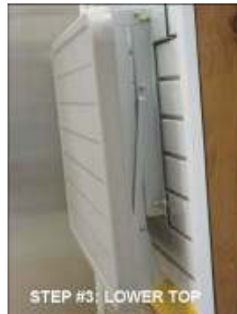
DIAGRAM OF OPERATING STEPS