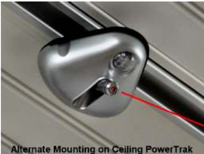
Alternate Mounting on Ceiling PowerTrak

THE GUIDE IS A CLASS IIIA LASER PRODUCT. THIS IS THE SAME RATING AS A SUPER MARKET SCANNER AND WILL NOT HARM YOU OR YOUR VEHICLE. HOWEVER, COMMON SENSE SHOULD TELL YOU, "IT IS NOT A TOY AND YOU SHOULD NOT LOOK DIRECTLY INTO THE BEAM".